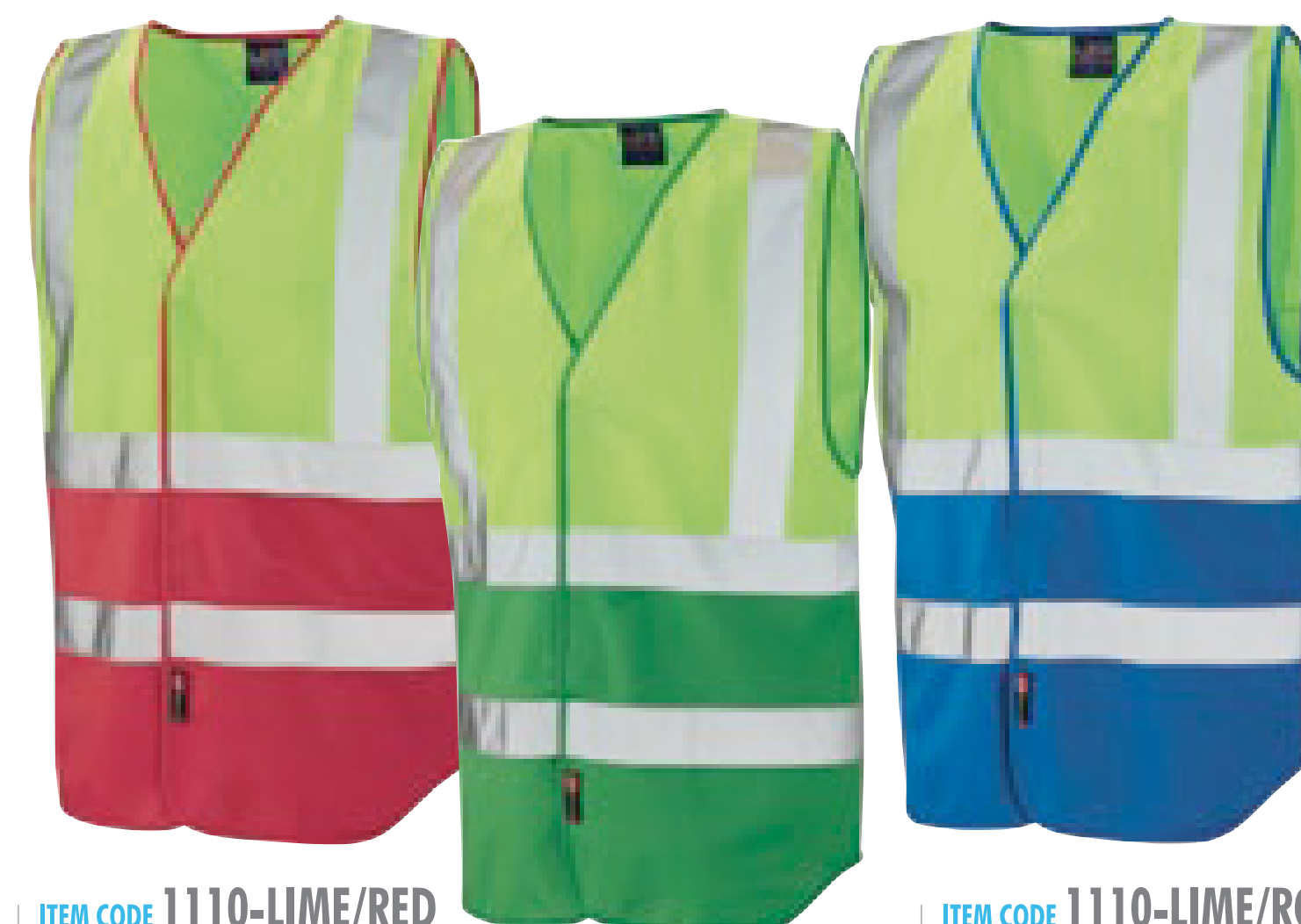
ITEM CODE 1110-LIME/RED COLOUR LIME/RED