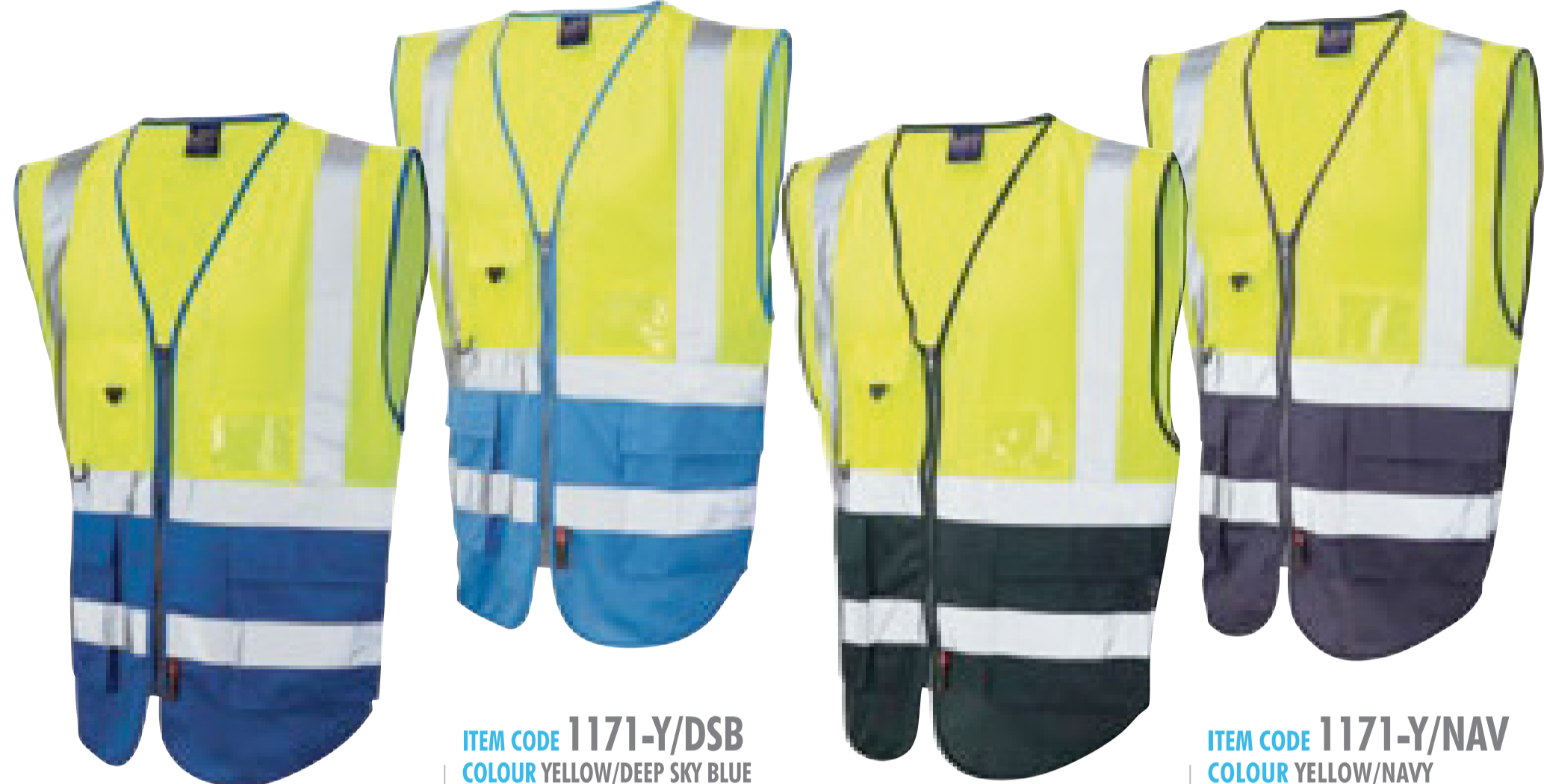
ITEM CODE 1171-Y/ROY COLOUR YELLOW/ROYAL EN471 CLASS 1