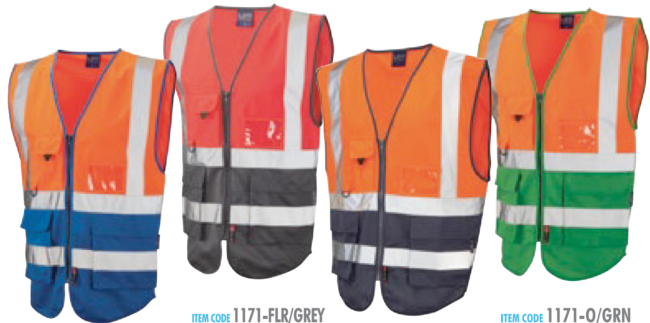
ITEM CODE 1171-O/ROY COLOUR ORANGE/ROYAL BLUE EN471 CLASS 1