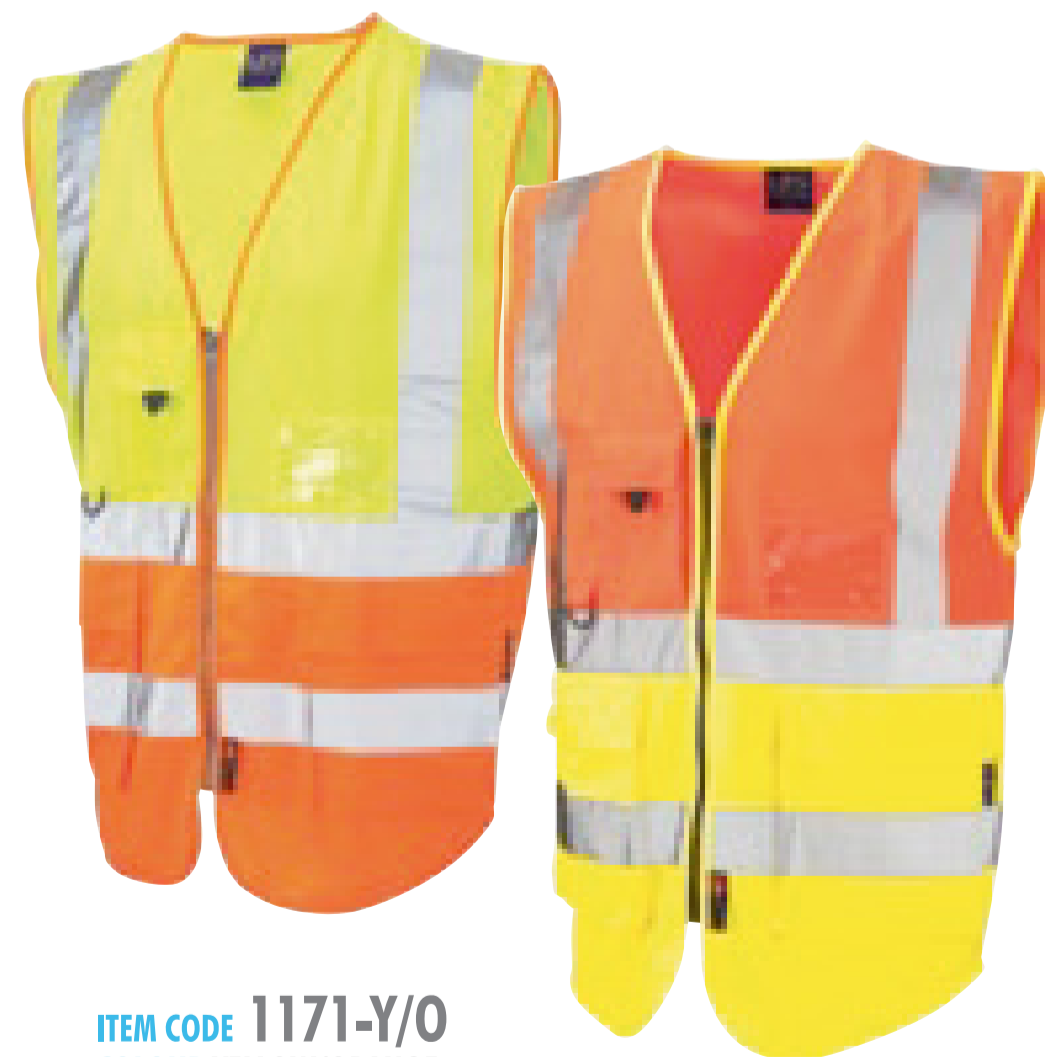
ITEM CODE 1171-Y/O COLOUR YELLOW/ORANGE EN471 CLASS 2