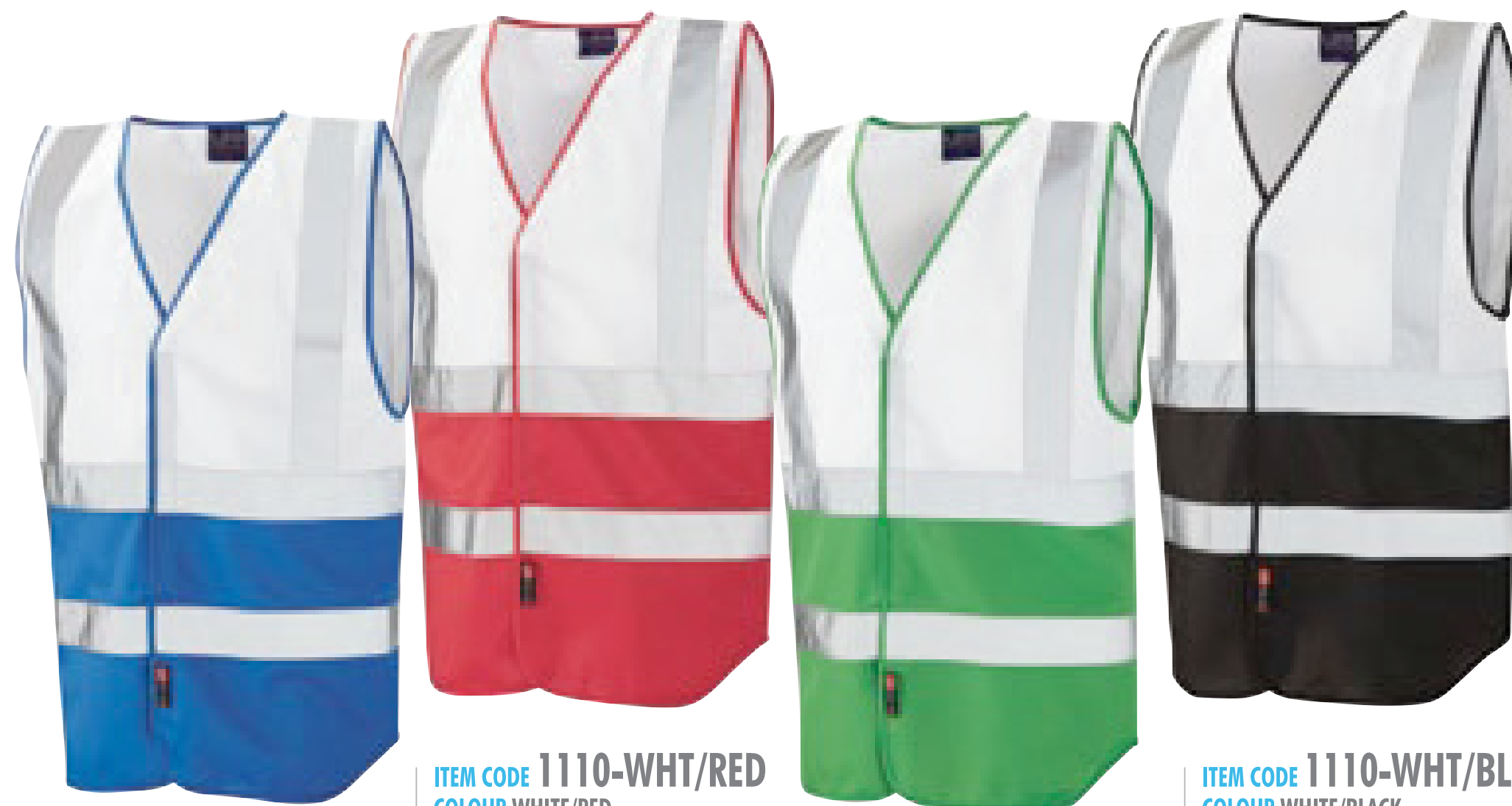
ITEM CODE 1110-WHT/ROY COLOUR WHITE/ROYAL BLUE