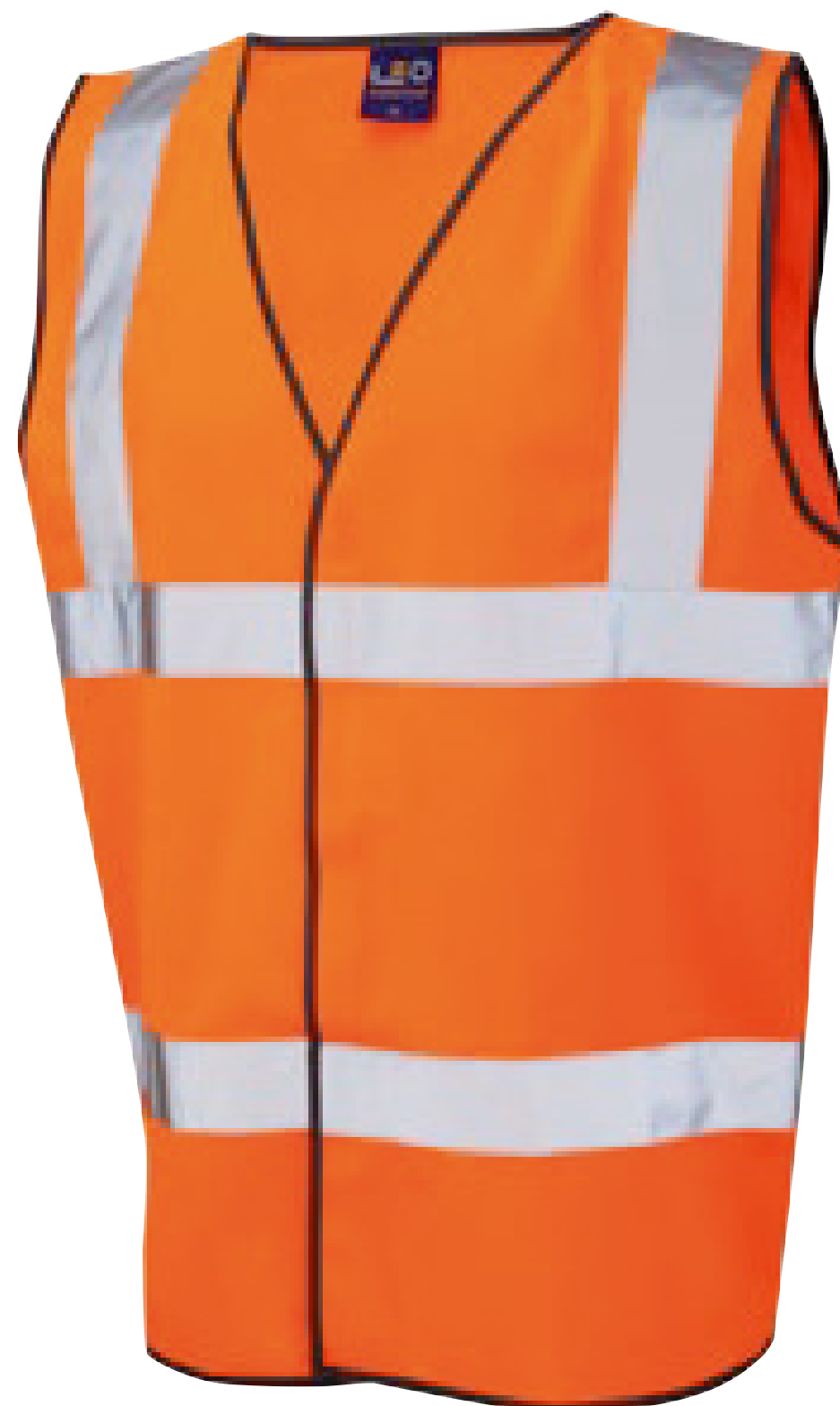
ITEM CODE BW02 COLOUR ORANGE