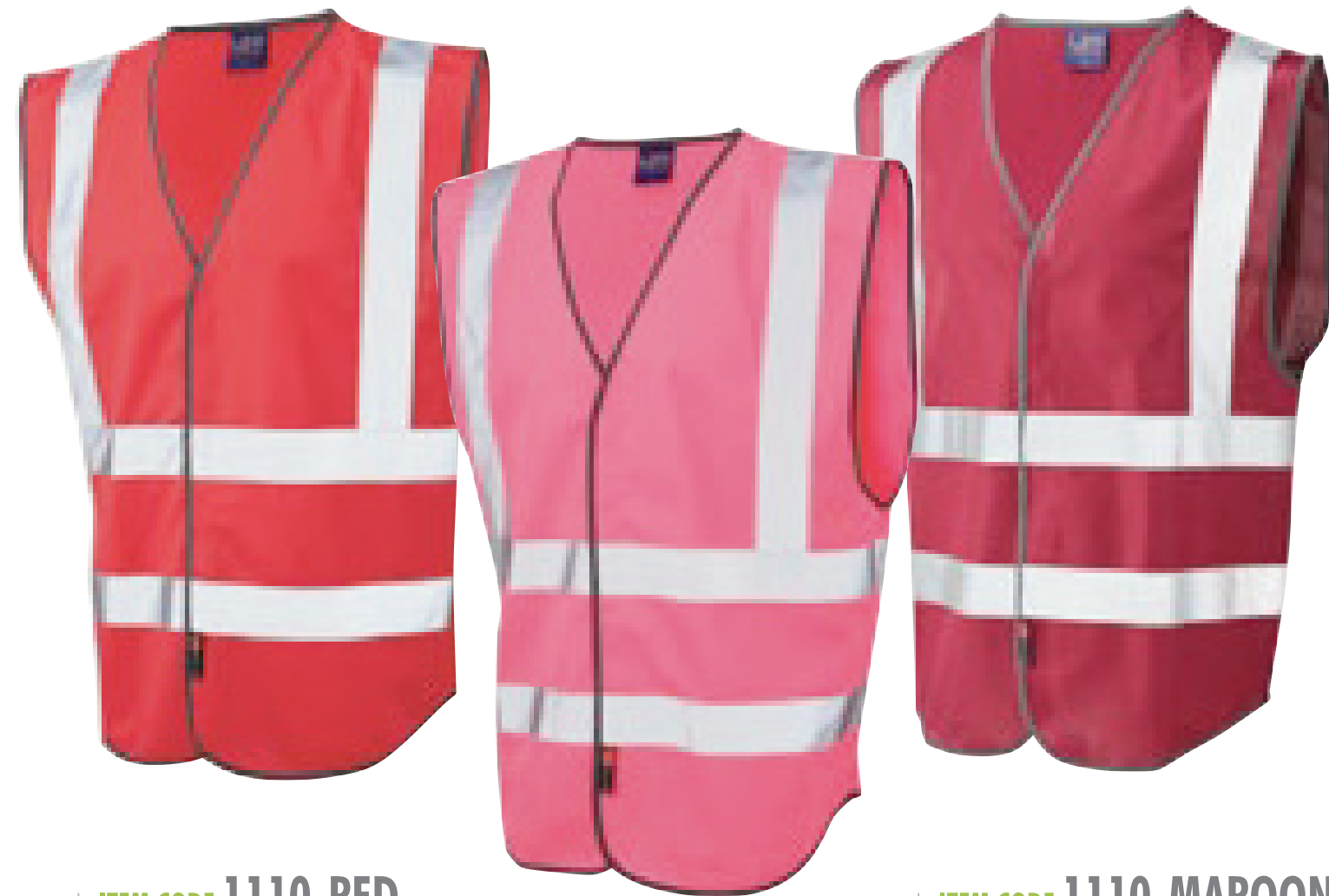
ITEM CODE 1110-RED COLOUR RED