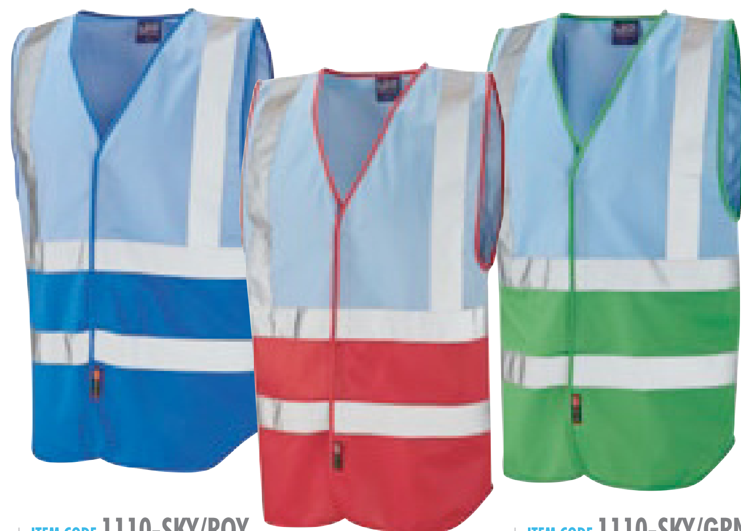
ITEM CODE 1110-SKY/ROY COLOUR SKY/ROYAL BLUE