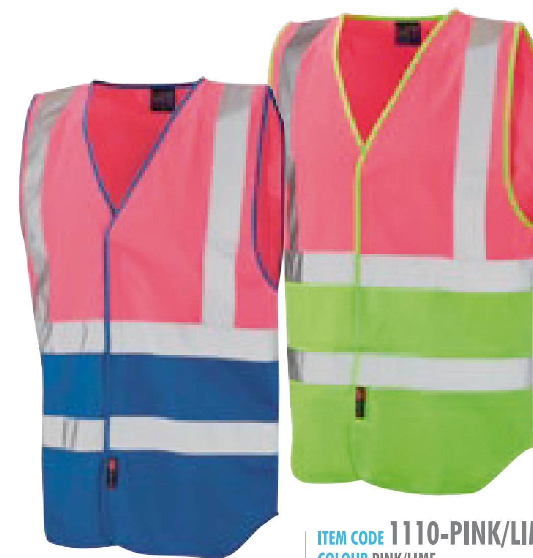
ITEM CODE 1110-PINK/ROY COLOUR PINK/ROYAL BLUE