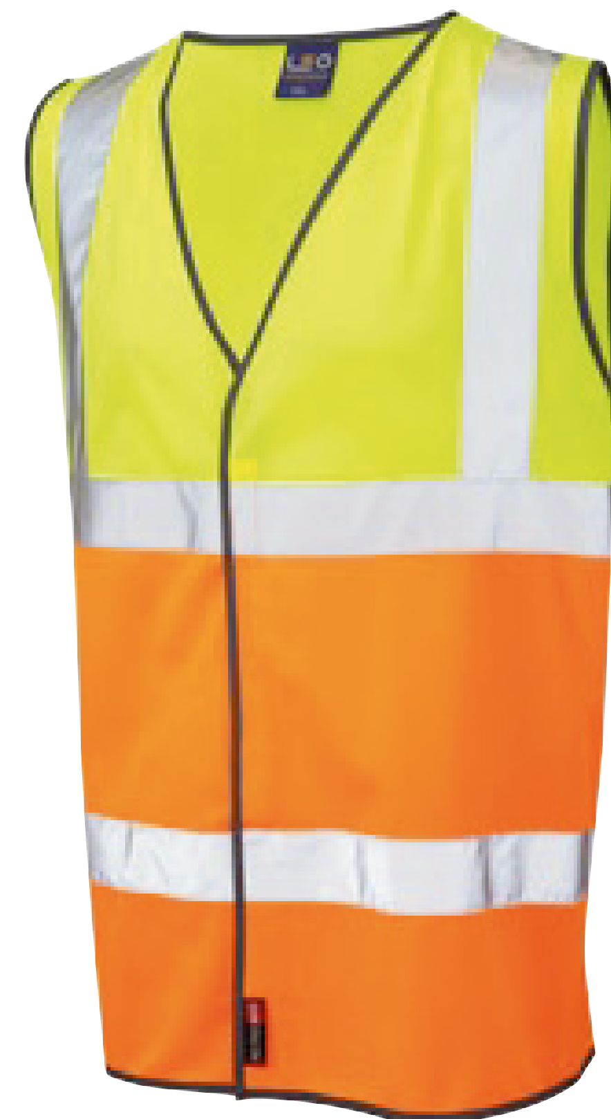
ITEM CODE 1131 COLOUR YELLOW/ORANGE