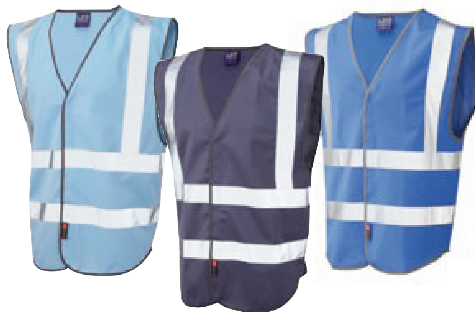
ITEM CODE 1110-SKY COLOUR SKY