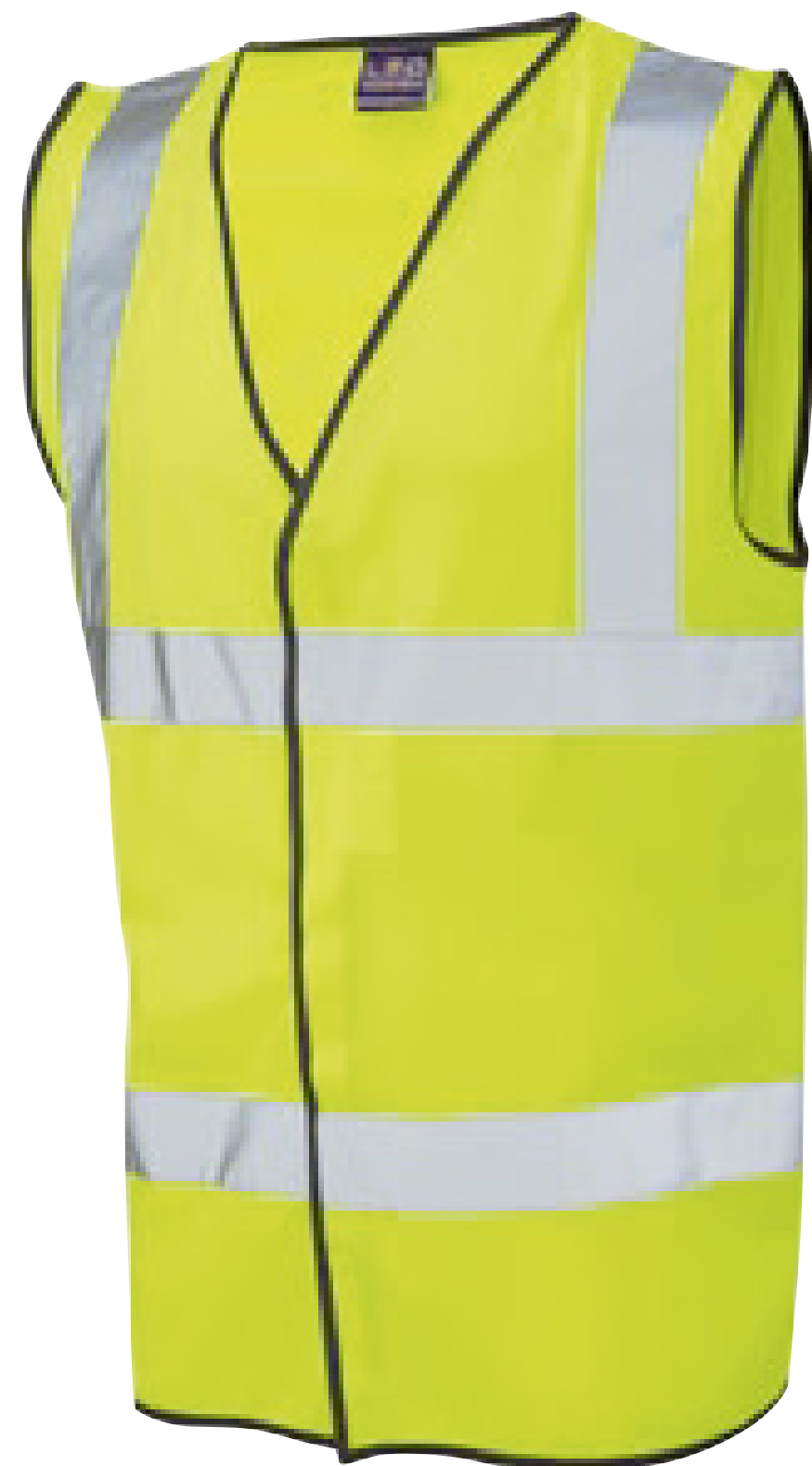
ITEM CODE BW2 COLOUR YELLOW