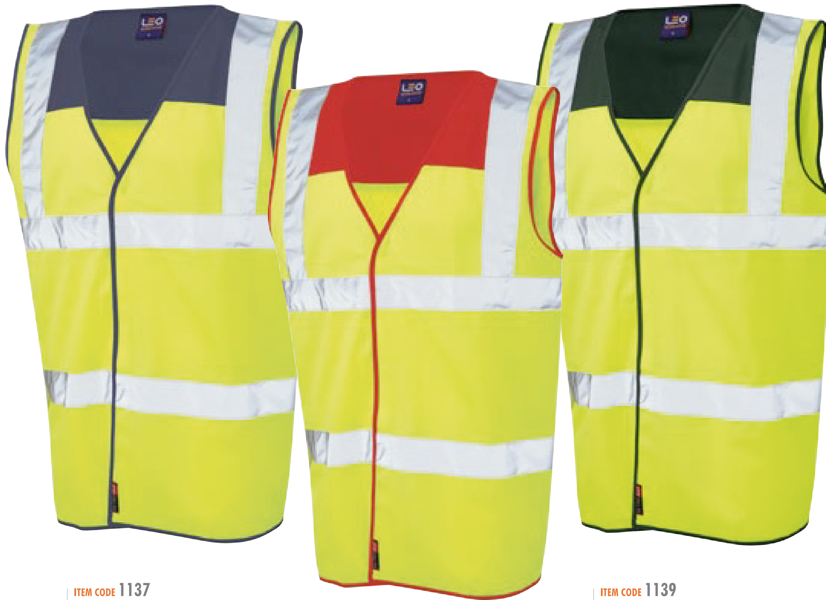
ITEM CODE 1137 COLOUR YELLOW/NAVY YOKE