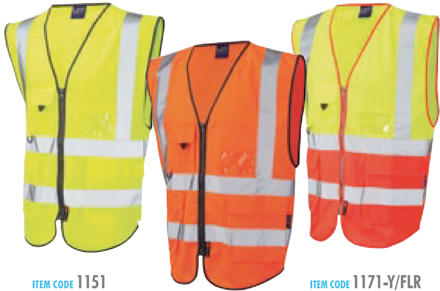
ITEM CODE 1151 COLOUR YELLOW EN471 CLASS 2