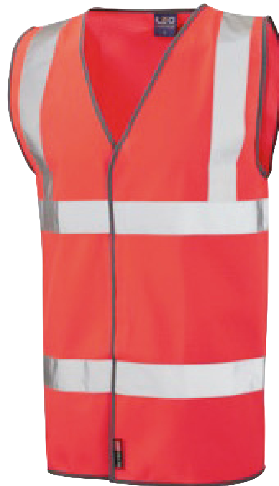
ITEM CODE BWR2 COLOUR HI VIS RED