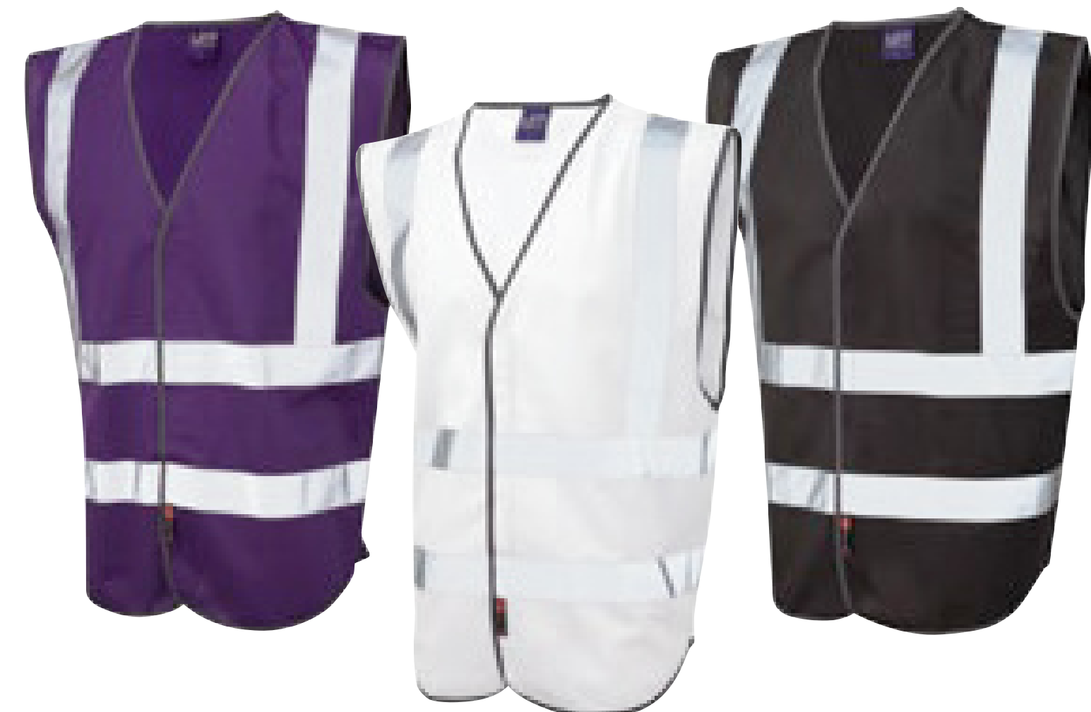
ITEM CODE 1110-PURPLE COLOUR PURPLE