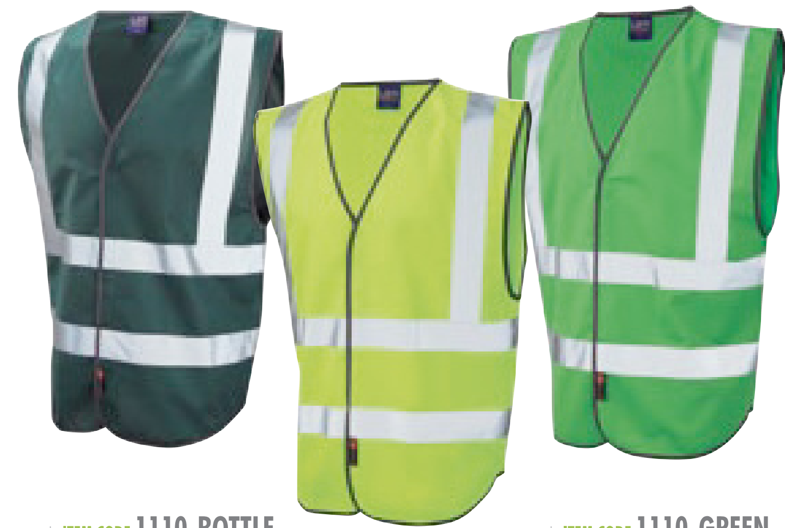
ITEM CODE 1110-BOTTLE COLOUR BOTTLE